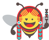
Queen of Hearts