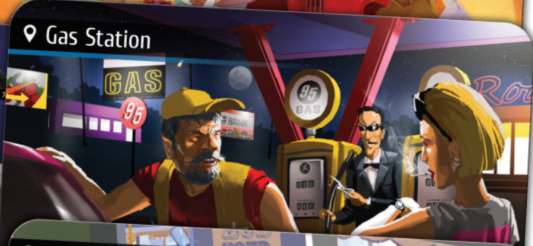
📍 Gas Station