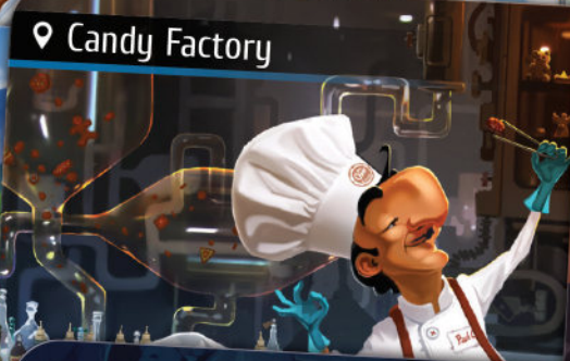
📍 Candy Factory