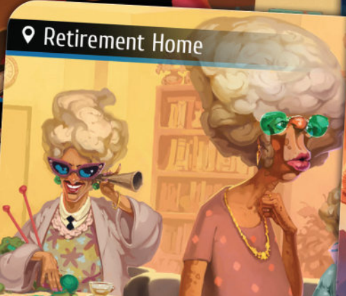
📍 Retirement Home