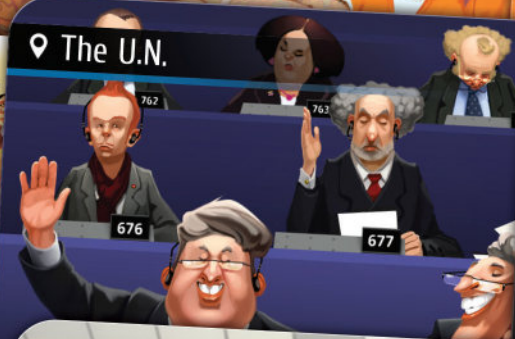
📍 The U.N.