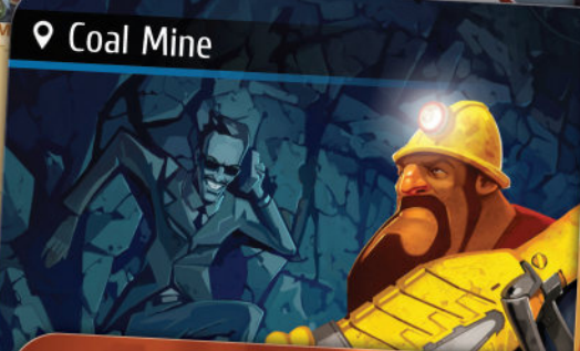
📍 Coal Mine