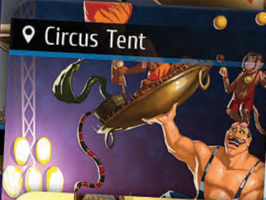
📍 Circus Tent