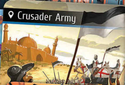
📍 Crusader Army