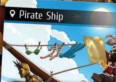
📍 Pirate Ship