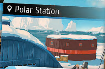
📍 Polar Station