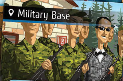
📍 Military Base