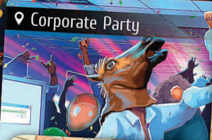
📍 Corporate Party